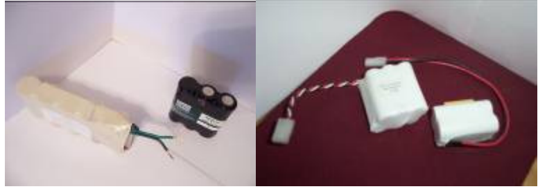
Various battery packs or numerous applications.

<u>Shrink-wrap</u> – A plastic material covering the majority of the exterior of the cell configuration or pack that is heat-formed, causing the plastic material to shrink and form tightly around the contents. These battery packs will also have terminations that could be one of the following: pressure contact, bare leads or a plug-type termination.