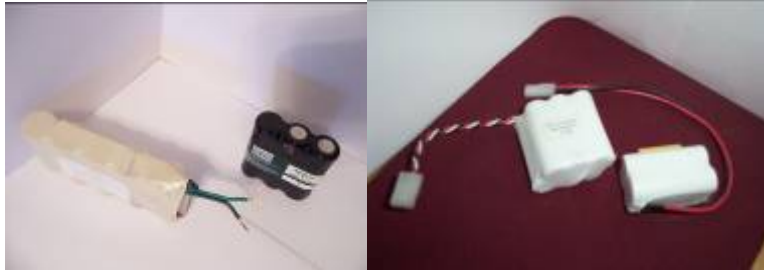
Various battery packs or numerous applications.

Shrink-wrap – A plastic material covering the majority of the exterior of the cell configuration or pack that is heat-formed, causing the plastic material to shrink and form tightly around the contents. These battery packs will also have terminations that could be one of the following: pressure contact, bare leads or a plug-type termination.