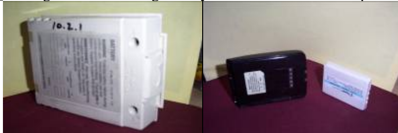
Defibrillator battery (left) come in many shapes and sizes. Wireless digital phone and cellular phone batteries (right) also come in many configurations.

Hard Case – A rigid exterior casing usually molded to fit on or in a particular device.